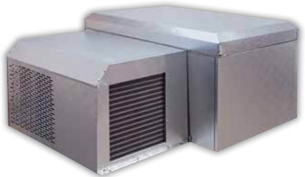
Indoor ceiling mount Capsule Pak (outdoor models also available)