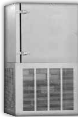
Indoor wall mount Capsule Pak