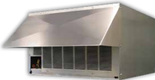
Outdoor Split-Pak condensing unit