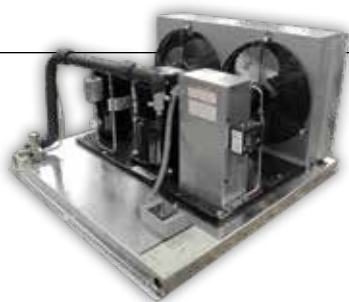
Indoor Split-Pak condensing unit